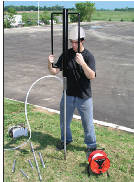
Installing Piezometers with a Manual Slide Hammer

Solinst Drive-Point Piezometers can be driven into the ground with any direct push or drilling technology, including the Manual Slide Hammer shown at right. To avoid clogging or smearing of the screen during installation, a shielded version is also available.