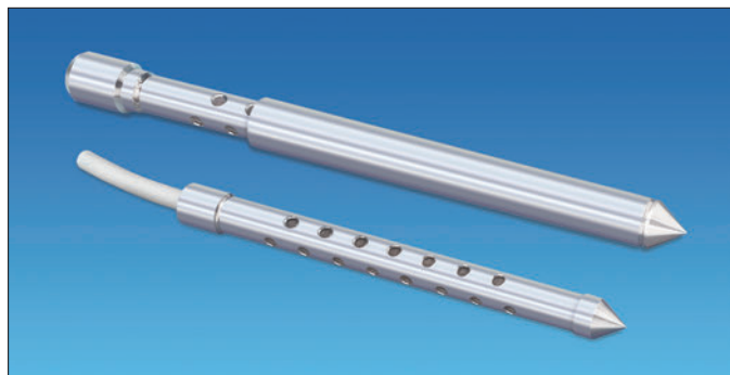
Model 615 Drive-Point and Shielded Drive-Point Piezometer